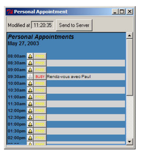
Figure 4: Window of user agenda

At this time most communication aids have been implemented. The scheduling agenda is global for an ERIM site, but each user handles it through a personalized view (cf. Fig. 4).