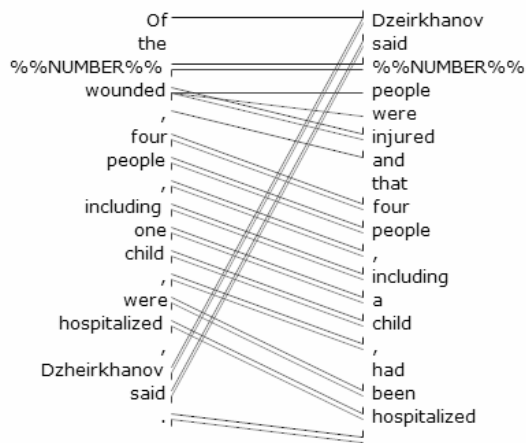
Figure 1. An example Giza++ alignment

they contained paraphrases before they were hand word-aligned.