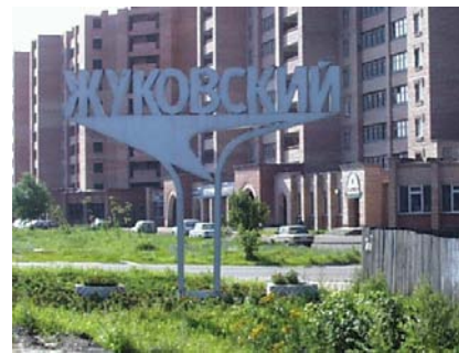
Figure 1 A sign embedded in the background

recognition of text in video imagery is challenging due to low resolution of characters and complexity of background. Research in video OCR has mainly focused on locating the text in the image and preprocessing the text area for OCR [4][6][7][9][10]. Applications of the research include automatically identifying the contents of video imagery for video index [7][9], and capturing documents from paper source during reading and writing [10]. Compared to other video OCR tasks, sign extraction takes place in a more dynamic environment. The user's movement can cause unstable input images. Non-professional equipment can make the video input poorer than that of other video OCR tasks, such as detecting captions in broadcast news programs. In addition, sign extraction has to be implemented in real time using limited resources.