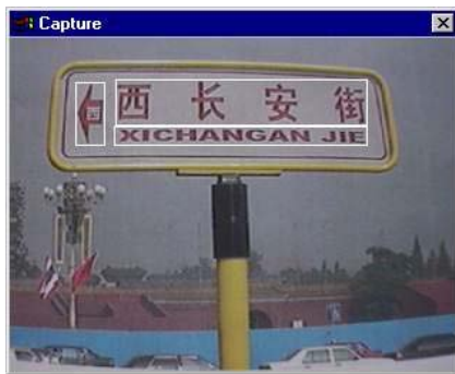
Figure 5 An example of automatic sign detection