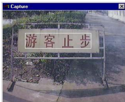
Figure 6 An example of false detection

Figure 7 illustrates two difficult examples of sign detection. The text in Figure 7(a) is easily confused with the reflective