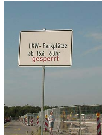
Figure 2 A German sign

Sign translation requires sign recognition. A straightforward idea is to use advanced OCR technology. Although OCR technology works well in many applications, it requires some improvements before it can be applied to sign recognition. At current stage of the research, we will focus our research on sign detection and translation while taking advantage of state-of-the-art OCR technologies.