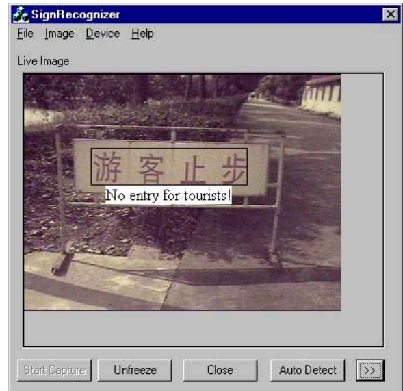
Figure 4 The interface of the prototype system

An efficient user interface is important to a user-centered system. Use of interaction is not only necessary for an interactive system, but also useful for an automatic system. A user can select a sign from multiple detected signs for translation, and get involved when automatic sign detection is wrong. Figure 4 is the interface of the system. The window of the interface displays the image from a video camera. The translation result is overlaid on the location of