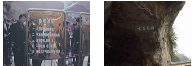
(a) (b) Figure 7 Difficult examples of sign detection

background. The sign in Figure 7(b) is embedded in the background