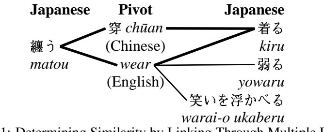
Figure 1: Determining Similarity by Linking Through Multiple Pivots

dictionary through linking Japanese and English through multiple pivots — the major difference is that we are not creating a new dictionary but instead increasing the size of an existing dictionary.