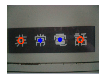
Figure 3: Two circles at the ends of the string are specified by the user with stylus. All the character locations (four locations) are automatically estimated.