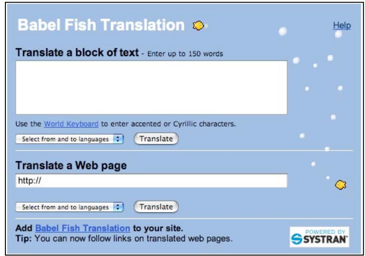
The Babel Fish Translation Portal

For example, you may have used the free translation Babel Fish portal, shown here.