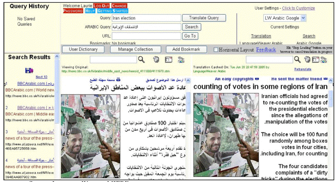
MITRE "Clipper" Search Engine

Language Weaver has worked with enterprise search companies such as Convera and FAST to integrate this functionality within their products. This allows an enterprise to make its content available to all employees, across multiple languages. Shown below is a search application developed by MITRE to provide English-language search results from Arabic-language queries.