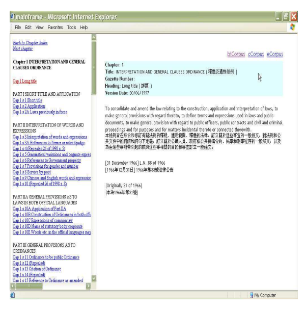
Figure 6: Illustration of browsing modes

A bilingual corpus of this size and quality covering a specific domain so comprehensively is particularly useful not only in empirical MT research but also in computational studies of bilingual terminology and legislation. Our future work will focus on word alignment for inferring bilingual lexical resources and on automatic recognition of legal terminology.