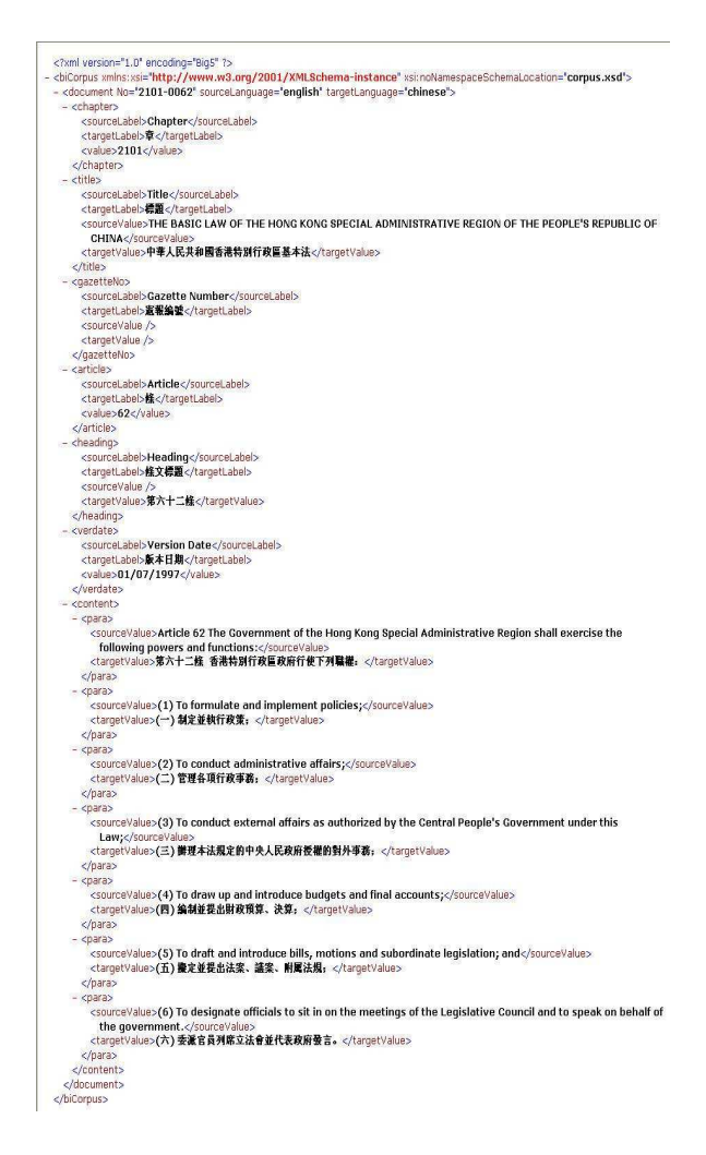
Figure 5: Sample bitext in XML encoding

Corpus size The entire corpus is of 10.4M English words and 18.3M Chinese characters, several times larger than the well-known Penn Treebank Corpus in size.