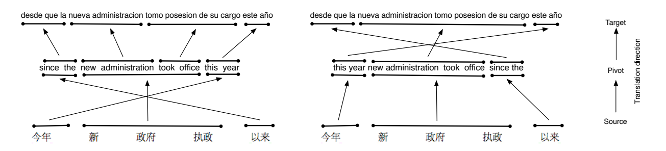
Figure 1: Phrase-based translation from Chinese to Spanish, through English, with independent alignments (left) and constrained alignments (right).