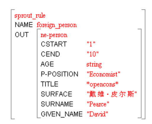
Figure 4: A Sample Feature Structure for Output from the Rule in Figure 3. Note that the type <code>ne_person</code> induces more features than are used in the rule, i.e. <code>AGE, TITLE, CSTART, CEND</code>. The latter two are the character positions of the matched piece of text and automatically instantiated by the SProUT interpreter.

We discuss now the processing according to Figure 2. A string of Chinese characters is first preprocessed using the Shanxi word segmenter. The result is subjected to SProUT rules that can identify pre-stored person names from the gazetteer of Chinese and foreign names and some unknown person names. There are SProUT rules that dispatch – upon recognizing a string of trigger characters – to the statistical module. The string is converted into Pinyin. The result is compared to the precomputed set of phonetic name representations using SILO. The best fit is returned, and a corresponding name (together with other gazetteer information) is returned to SProUT.