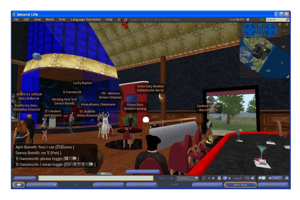
Figure 2: Screen shot of the modified Second Life viewer where conversations

Similar to human beings, statistical machine translation (SMT) systems (Brown et al., 1990; Och et al., 1999) also need to know the context to translate sentences correctly. Some verbal context can be encapsulated in phrases. Translating the phrase as one unit thus can resolve some ambiguities of words inside the phrase. The standard n-gram language model, a crucial component in statistical machine translation system, estimates the probability of generating the next word given the history/context of already translated words. In a sense, the phrase-based SMT systems improve greatly over word-based systems because they use phrases to encapsulate the verbal context.