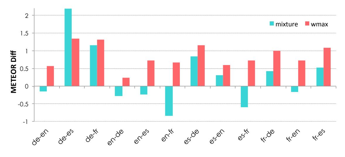
Figure 4: Meteor score difference between mixture models and direct systems as well as the difference between ensemble decoding approach with wmax and the direct system.