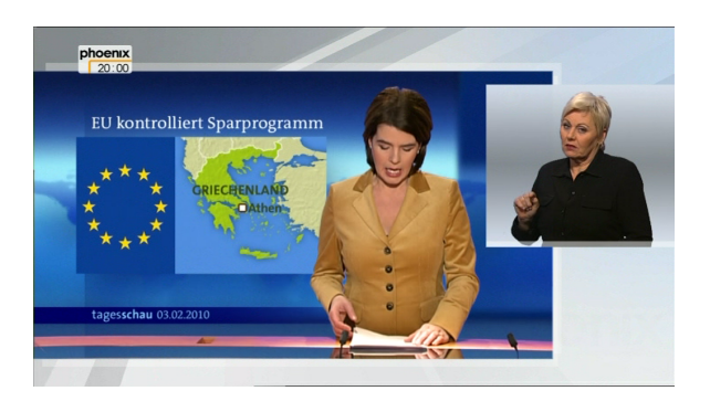
Figure 1: Snapshot of the PHOENIX broadcast news

In this paper, we use a phrase-based and a hierarchical phrase-based decoder and also apply system combination to some hypotheses. In the following, we will describe the systems that we used.