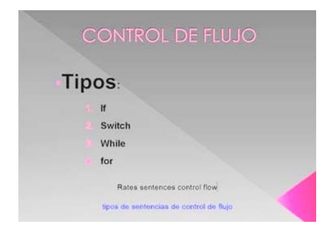
Figure 1: Example as seen through demonstration The last two lines are superimposed to the projection of the slide. In blue appears what the teacher said; while black is the corresponding translation.