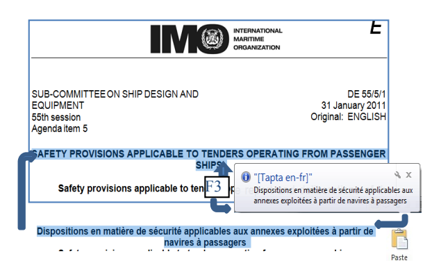
Figure 1: Translating with the "auto hotkey"

A web interface allows users to submit short texts and access the corresponding automatic