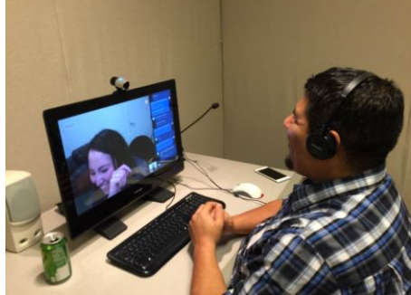
Skype Translator Usability Lab, Mountain View – February 3rd 2015