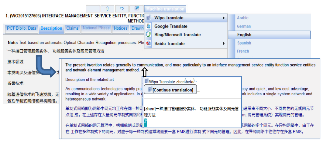
Figure 3: WIPO translate widget example, online translation of a Chinese description

This widget can be smoothly included on any page, it is currently available on the description page, but also for the claims page, the bibliographic page and the result list.