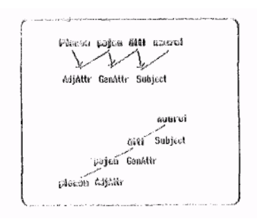
a) A monotonous dependency tree