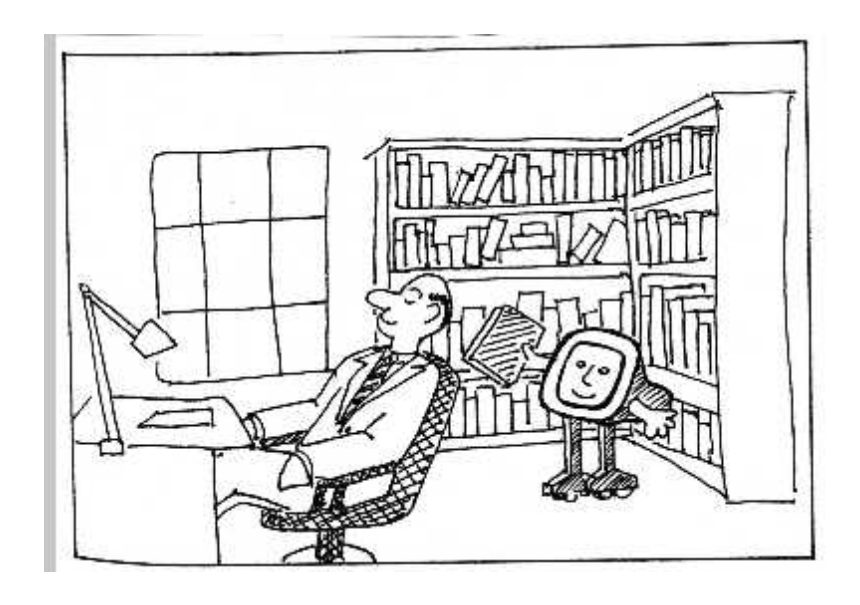
Translation Aids in the Workplace No. 72: Automatic Lexical Lookup

You are translating a technical text by hand. You click on the icon Term Support and all the source language terms in the current text unit which are recognised as being in the electronic term dictionary are highlighted. A second click causes all the translations of those terms to be inserted in otherwise empty target language sentences. You then type in the rest of the translation around each inserted term.