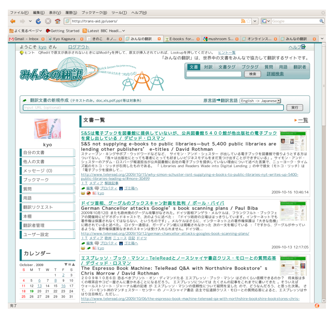
Figure 2. A personal user space in MNH

login box for registered users, and a list of translators who have recently published translations on MNH.