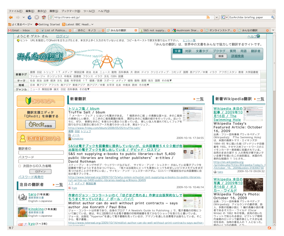
Figure 1. The top page of MNH

paper introduces the translation hosting aspect of MNH, and section 3 details the built-in translation aid editor QRedit. In section 4, we explain the community building functions as well as the educational functions provided by MNH. Section 5 describes the system's reference sources, and section 6 introduces its current state of usage. Section 7 concludes the paper.