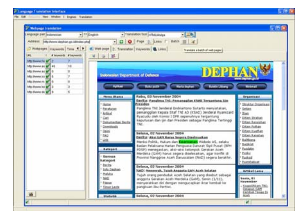
Figure 4. The LTI: Web Translation Tool

During the three weeks of the exercise, we collected feedback from both users and visitors to the exercise. Then, a new version of the tool was specifically developed for a particular environment, with automated web access being the main priority. This is the Web Translation Tool, shown in Figure 4.