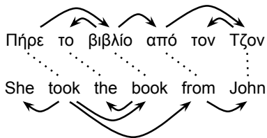
Figure 3: A Greek and English sentence pair. Word alignments are shown as dashed lines, dependency arcs as solid lines.

from → John . These add 3 to the score. There is one incorrectly aligned dependency: the preposition mistakenly modifies the noun on the Greek side. This subtracts 1. Finally, there are two dependencies that do not align: the subject on the English side and a determiner to a proper noun on the Greek side. These do not effect the result.