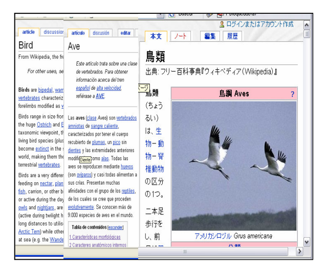
Figure 1. The article "bird" in English, Spanish and Japanese

Take all articles titles that are nouns or named entities and look in the articles' contents for the box