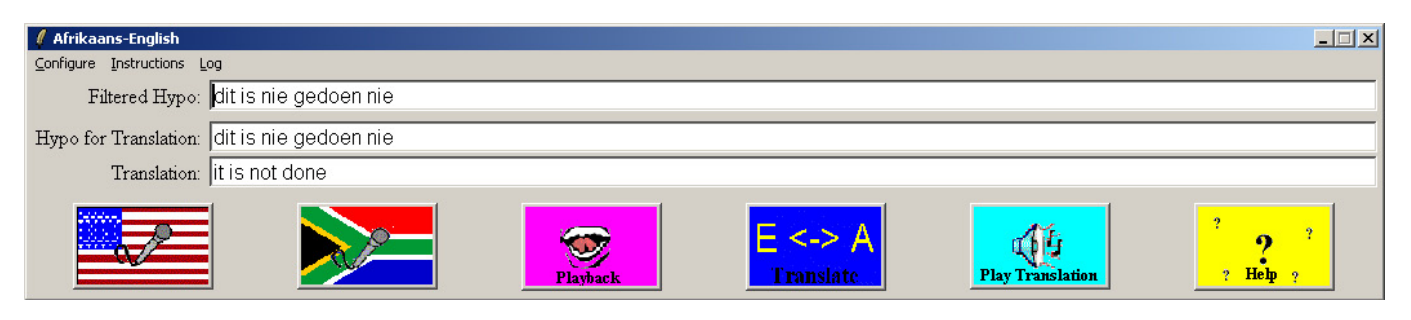
Figure 2: An example of Afrikaans-English translation prototype.

ing was done to develop the prototype: (i) the recogniser was replaced with an Afrikaans recogniser; (ii) the SMT transducers were replaced with Afrikaans-English and English-Afrikaans transducers; and (iii) the speech synthesis voice was replaced with an Afrikaans voice. The integration, adaptation and evaluation of the prototype system is estimated to have taken one week. Figure 2 shows the interface of the demonstration prototype system.