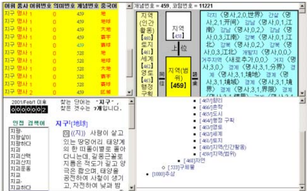
Figure 3: Korean-Chinese Wordnet