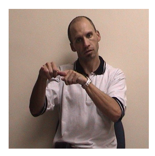
Figure 1: Image frame taken from an SASL video showing the sign FLIGHT-X

The basis for the translation into SASL were the English sentences. Twenty sentences covering all different aspects of the corpus were chosen and carefully translated by a deaf native SASL speaker. This was recorded and annotated into glosses. From this basis, the remaining sentences were translated into glosses too. Again, emphasis was put on capturing the location placement in signing space correctly. Figure 1 shows an image frame from the SASL recordings where the signer signs FLIGHT-X, pointing (X) with his dominant hand to the sign FLIGHT shown by his non-dominant hand.