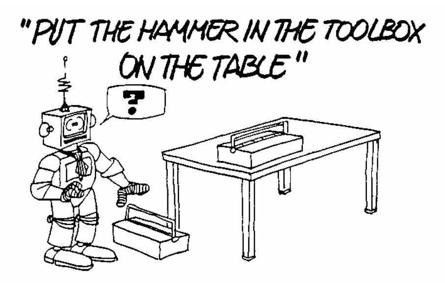
Fig. 2 Ambiguity is the biggest hurdle in MT, as it is in robot control.

AI-related processing with its intensive pattern matching will profit from the clear morpheme structure of Esperanto words. To exploit this phenomenon for DLT, a powerful intra-word grammar has been written in 1986. This word grammar will enhance not only semantic disambiguation, but also semi-automatic term creation.