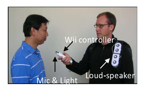
Figure 1: The users interact with the system

Our system is designed for eyes-free use and hence provides no graphical user interface. This allows the user to concentrate on his surrounding environment during an operation. The system only provides audio control and feedback. Additionally the system operates on a push-to-talk method. Previously the system (Hsiao et al., 2006; Bach et al., 2007) needed 2 buttons to operate, one for the English speaker and the other one for the Iraqi speaker.