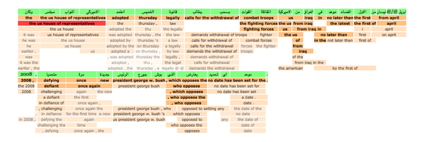
Figure 1: Translation Options shown to the monolingual translator. The machine translation of the Arabic input sentence is: The us house of representatives adopted thursday a law calls for the withdrawal of us combat troops from iraq by the first of april 2008, defying once again president george bush who opposed to setting any date.

be remedied as suggested above: their texts may be edited by a more qualified translator, or their domain knowledge may augment the language skills of a collaborating translator.