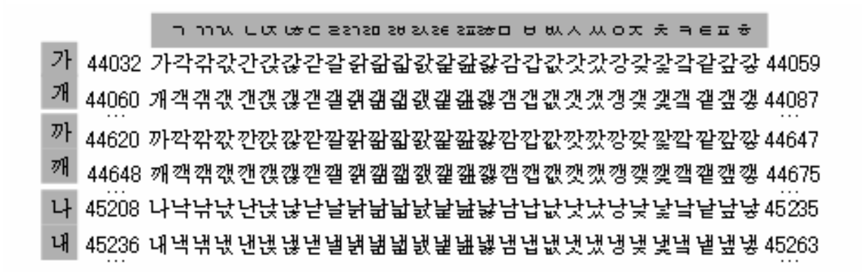
Figure 4. Fragment of the Unicode table for Korean Hangul characters.